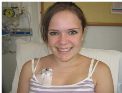
With needle in place for treatment