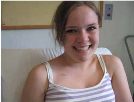
Before insertion of needle