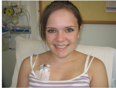
With needle in place for treatment